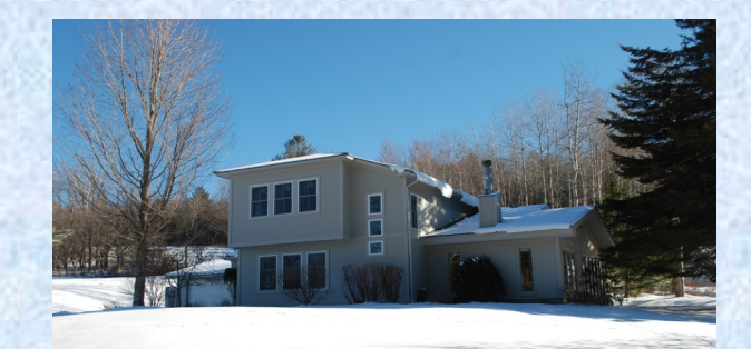
WARREN $475,000 — Rare ownership opportunity in the most coveted area along East Warren Road.