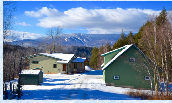
WAITSFIELD $649,000—Enjoy complete privacy with amazing western views of Sugarbush from this elegant, contemporary custom Post & Beam home.