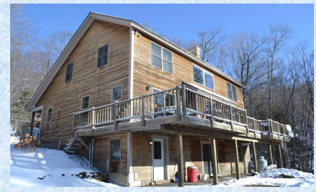
FAYSTON $549,000 — Here's a custom built home by a well-respected local contractor.