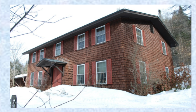
MORETOWN $449,000 — Drive over the river and through the woods to be greeted by this great opportunity to live in a country home with old-world feel.