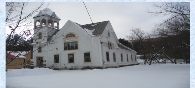
WAITSFIELD $399,000 — This architectural gem features great spaces, ample parking, high Main Street visibility, and lots of incredible potential.