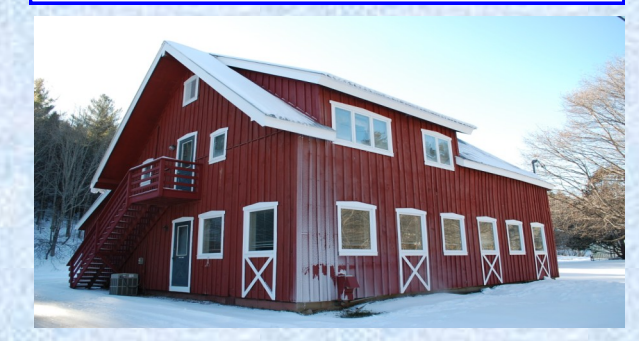
FAYSTON $350,000 100 seat restaurant in high traffic area of the Mad River Valley. Fully equipped with a large commercial kitchen and plenty of storage.