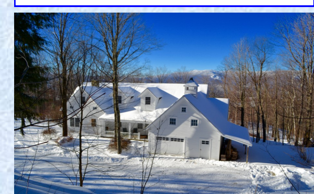
WARREN $849,000-Perched high in the hills of East Warren, this property offers incredible privacy with exceptional western views of the Green Mountains and Sugarbush Resort.