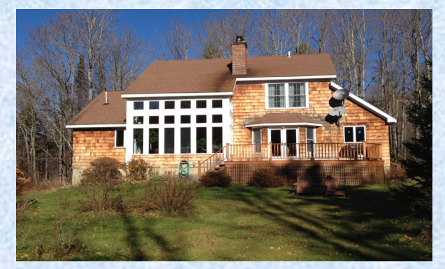
GRANVILLE $329,000 Big Green Mountain views and 10+ acres! This home offers a bright, granite kitchen, wonderful, open floor plan, living room with fireplace, vaulted ceiling and wall of windows.

NORTHFIELD $349,000 120 ac HUGE PRICE REDUC-TION! The very best of Country life! Enjoy end of the road privacy with mountain views and southern exposure.