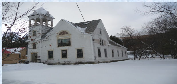
WAITSFIELD $399,000 — This architectural gem features great spaces, ample parking, high Main Street visibility, and lots of incredible potential.