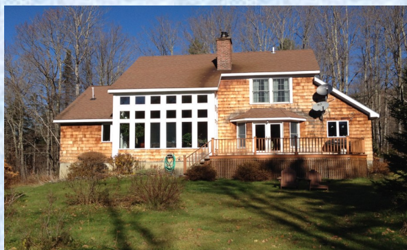
GRANVILLE $329,000 Big Green Mountain views and 10+ acres! This home offers a bright, granite kitchen, wonderful, open floor plan, living room with fireplace, vaulted ceiling and wall of windows.