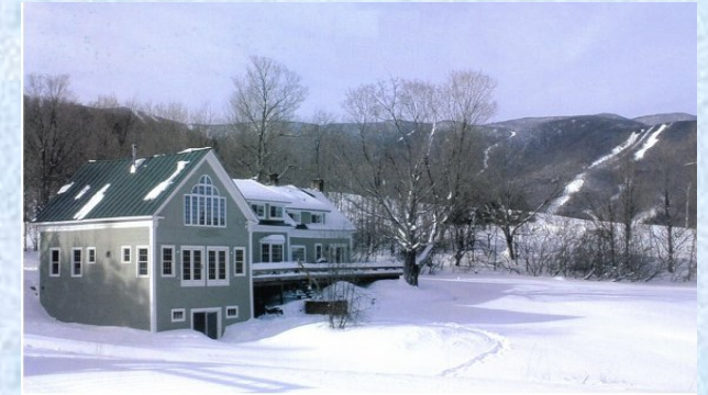
WARREN $925,000 —Currently serving as a distinctive and intimate bed and breakfast, the circa 1840's farmhouse has been elegantly restored to preserve its historic Vermont charm.