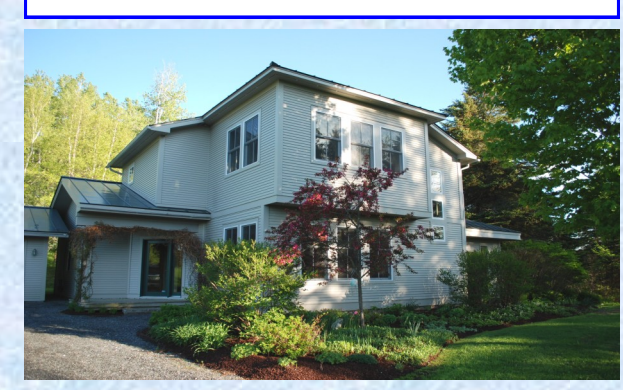
WARREN $475,000 —Rare ownership opportunity in the most coveted area along East Warren Road.