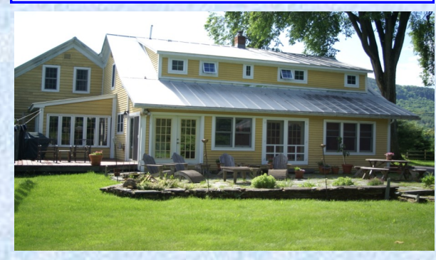
WAITSFIELD $399,000 —Surrounded by farmland and views of the Northfield Mountain Range this Farmhouse offers style, tradition and value.