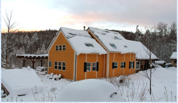
WARREN $429,000 - A truly rare opportunity to own a property that borders hundreds of Green Mountain National Forest acres and Blueberry Lake.