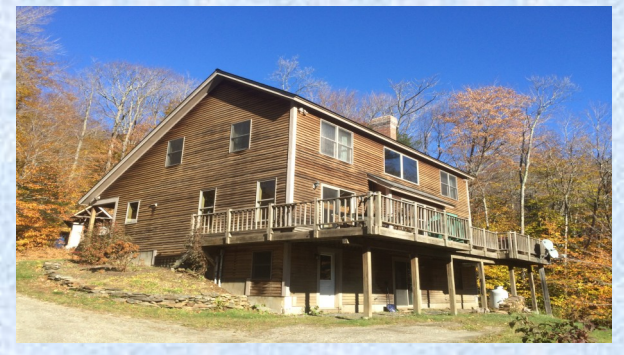
FAYSTON $549,000 — Here's a custom built home by a well-respected local contractor.

WAITSFIELD $649,000—Enjoy complete privacy with amazing western views of Sugarbush from this elegant, contemporary custom Post & Beam home.