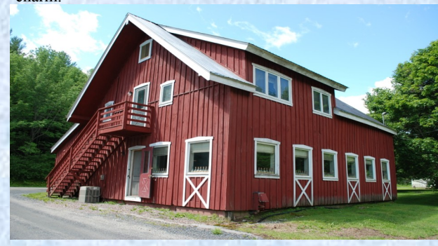
FAYSTON $350,000 100 seat restaurant in high traffic area of the Mad River Valley. Fully equipped with a large commercial kitchen and plenty of storage.