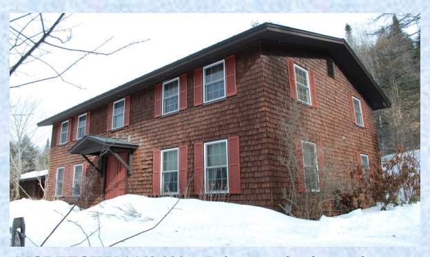
MORETOWN $449,000 — Drive over the river and through the woods to be greeted by this great opportunity to live in a country home with old-world feel.