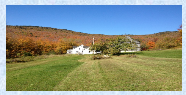
NORTHFIELD $349,000 120 ac HUGE PRICE REDUCTION! The very best of Country life! Enjoy end of the road privacy with mountain views and southern exposure.